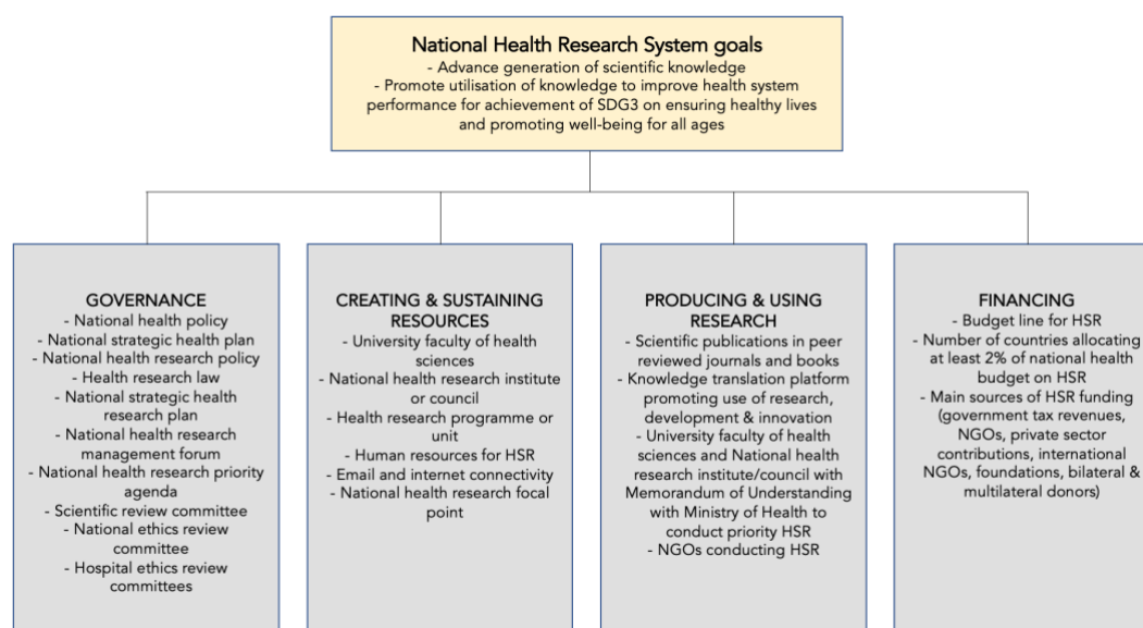
Figure 1. Reproduction of NHRS Pillars, adapted from Kirigia, et al. 2015 (55)

These pillars have also been used within international efforts to assess aspects of health research across countries (see Figure 1 ). In the African region, for example, based on Pang et al.'s work, the WHO Africa Regional Office developed a set of NHRS indicators, the 'African Barometer,' for routine monitoring of development of the pillars: health research policies and governance; human and institutional resources for health research; health research knowledge production, translation, and use; and health research financing. (56–60) But this descriptive analysis does not on its own answer the questions that decision-makers, funders, and researchers have about how to organise and support the development of NHRS in African countries in a holistic and sustainable way.(61,62)