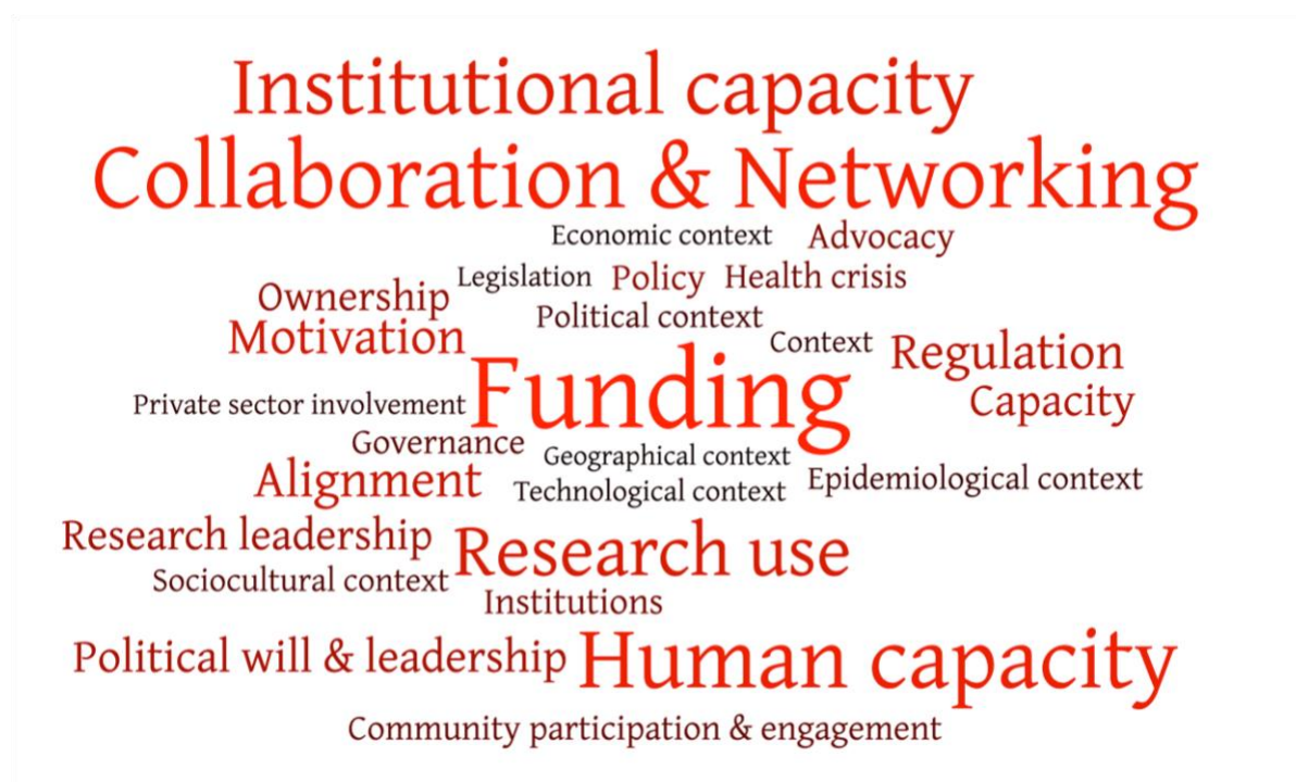
Figure 2. Key Themes in the Data from Key Informant Interviews

The findings presented in this report are based on comparative empirical analysis from the project, focused on understanding what actors in African states are doing to build strong NHRS and the challenges they face in doing so. Figure 2 displays the frequency of prominent themes in the data visually in a word cloud, while the detailed results herein are organised thematically, under three main chapters.